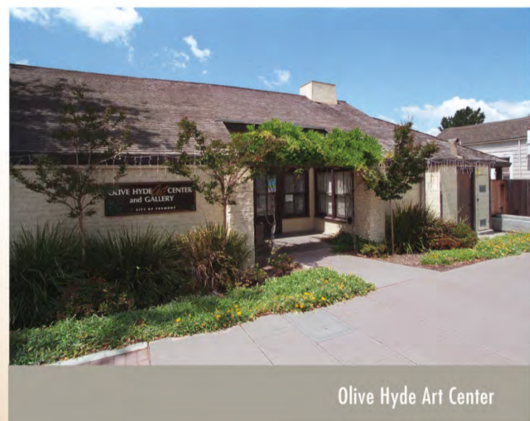
Olive Hyde Art Center

When California became a state in 1850, the Valle de San Jose included the pueblo of San Jose as well as the lands of Mission San Jose. Washington Township (present day Fremont, Newark and Union City) was part of Santa Clara County until 1853 when Alameda County was created. The confusion between Mission San Jose and the pueblo of San Jose began with early travelers and continues today. For many years and in many books the mission was incorrectly called Mission San Jose de Guadalupe. The Guadalupe River is near the city of San Jose and has no connection to this mission.