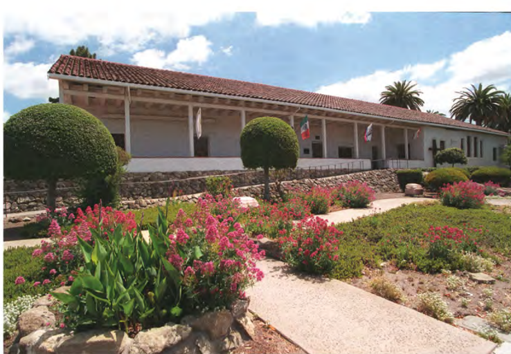
Mission San Jose Museum