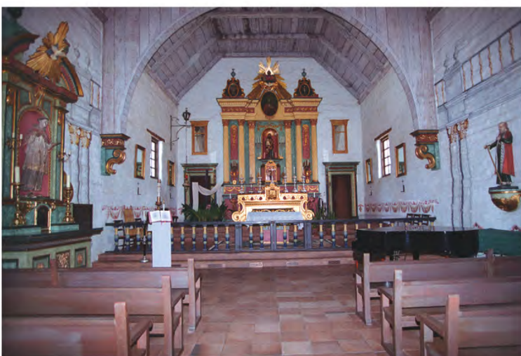
Interior of Mission Church