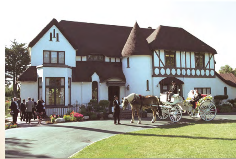
The Best House at Palmdale Estates