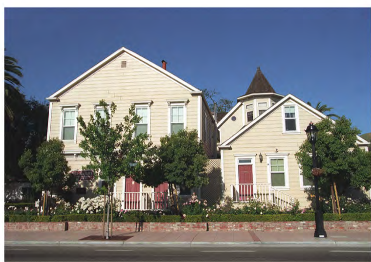
Washington Hotel and Brown Barbershop

South of the mission museum is a charming bed and breakfast inn and reception center. Call (510) 490-0520 for reservations. It combines two historic buildings, the Washington Hotel and the Brown Barbershop (43344) . The three-story home behind the inn is a modern addition. During the Gold Rush, Mission San Jose became a thriving provisioning center and the adobe buildings on the east side of Mission Boulevard were used as homes and shops. After the adobe structures were destroyed by earthquake, gold rush commercial style wooden stores were built between the hotel and Anza Street. They burned in the town fires of 1884 and 1894. The Dominican Sisters owned the property until 2001 when they sold it for residential and commercial development. The historic Montealegre/Gallegos mansion , a private residence, is up the hill at 830 Witherly Lane.