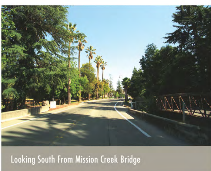
Looking South From Mission Creek Bridge