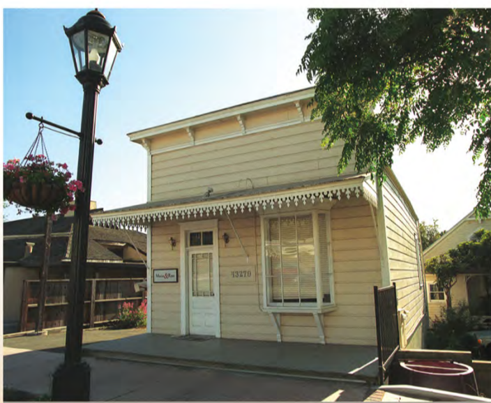
Steinmetz Harness Shop